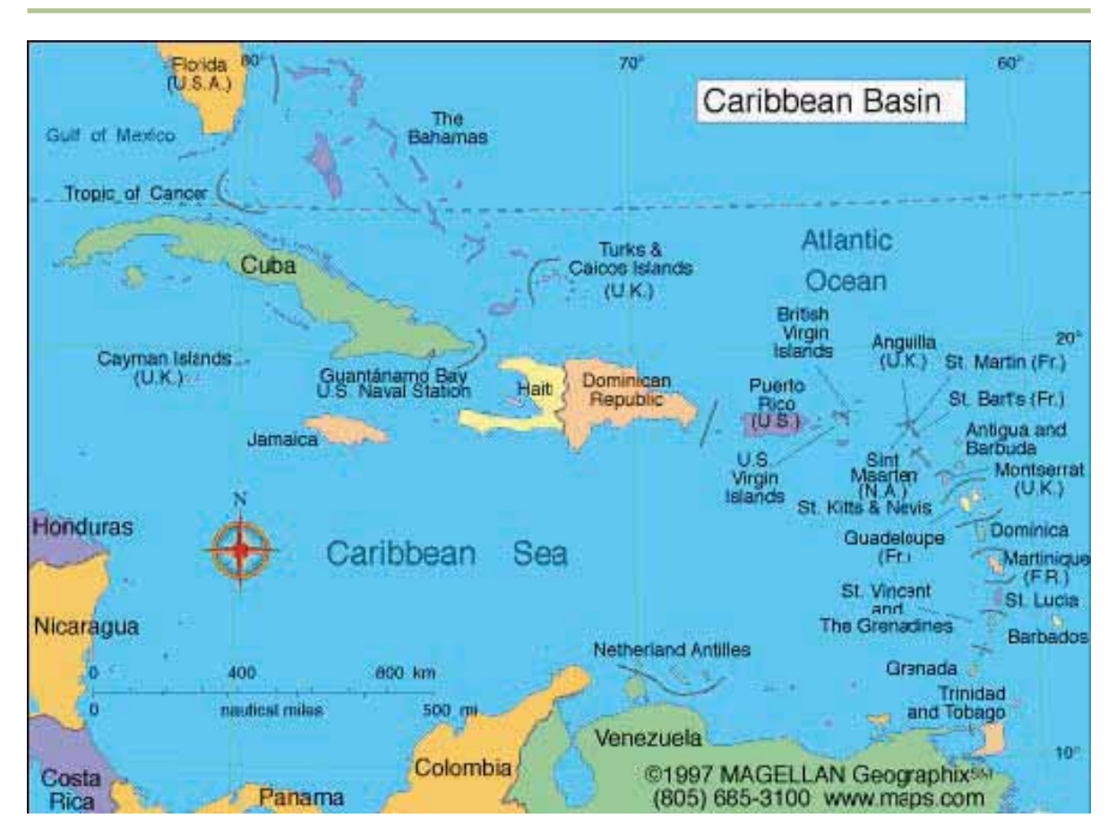
FIGURE 1 Location of Trinidad and Tobago within the Caribbean Region